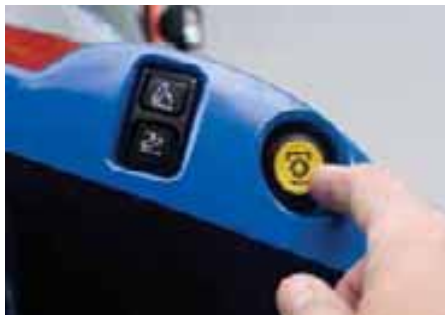
Switches for both the PTO and three-point hitch are provided on both rear fenders for easy control from the ground.

reversible 540/1000 rpm PTO shaft. An exterior PTO switch is provided on each of the rear fenders. If you press the button for less than five seconds, you get a pulsing action that makes it easier to hook up the PTO shaft. Hold the button for longer than five seconds to fully engage the PTO.