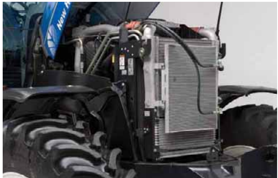
The common rail fuel injection system and electronic fuel management boosts fuel efficiency and engine performance.