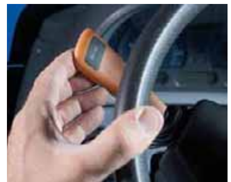
Clutchless power shuttle is electro-hydraulically engaged and located to the left of the steering column for easy fingertip control

The 28Fx12R creeper transmission is available for specialty applications requiring extra slow ground speeds; with a minimum speed of 12.3 feet per minute.