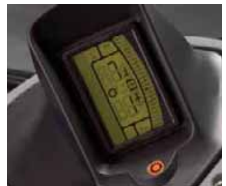
The Power Command digital display makes it easy to see your gear selection and functions such as auto-shift and custom Headland Management.