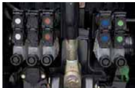
Hydraulic control levers and remote coupler dust covers are color-coded to assist with easy implement hook up and control.