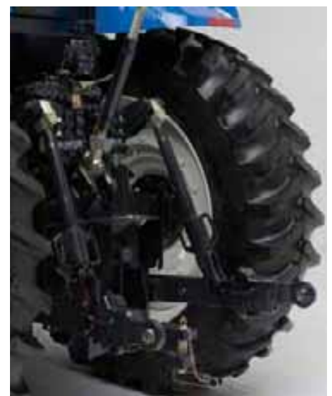
Standard Dynamic Ride Control™ helps prevent three-point-mounted implements from "bouncing" on the rear hitch during transport. You enjoy greater steering control, added safety and a smooth, comfortable ride.