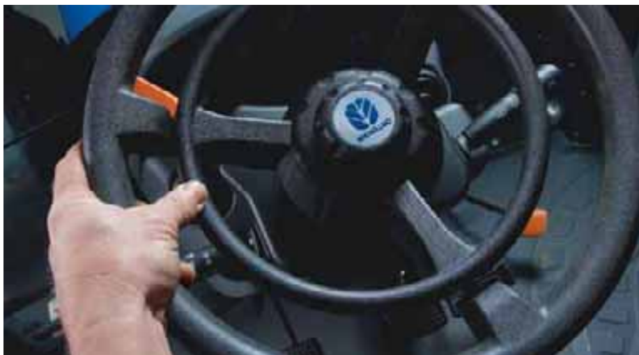
To engage FastSteer, simply press on the inner ring of the steering wheel. The FastSteer system automatically disengages when travel speed exceeds 6.2 mph.