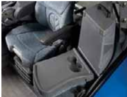
A storage box with drink holder is standard equipment on both standard and deluxe cabs.