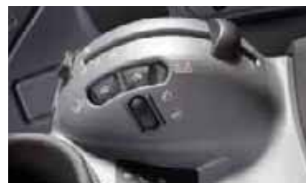
Electronic draft controls are located for easy access and adjustment.

Electronic Draft Control allows for precise, automatic control of three-point-mounted implements using lower link draft sensing to maintain a constant load on the hitch through changing soil conditions.