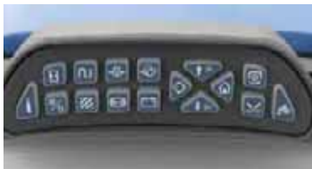
The enhanced instrument cluster with deluxe keypad allows you to program and view additional functions to keep you on top of all operations.