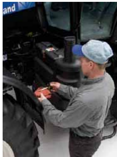
You can check the oil without raising the hood.