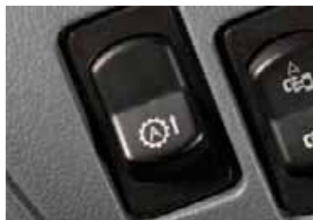
The Power Command™ transmission will automatically shift up or down within a span of gears based on engine RPM and applied flywheel torque. Just press the “Auto” button to engage automatic shifting in the field or on the road.