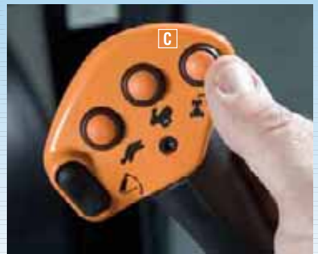
These switches on the right-hand console are used to alert the system that you are ready to record (A) or play back (B) a sequence of actions. Then, press the “step” button on the multi function controller (C) to actually activate the recording or playback.

the headland, you press one button and the system will automatically throttle back, change gears and raise the implement. Press the button again, and the system repeats the second sequence you recorded to get you back in the row and on your way. Add this convenience to the easy turning you get with the FastSteer™ option, and you reduce the effort required at the end of the row to pushing the headland button, press-