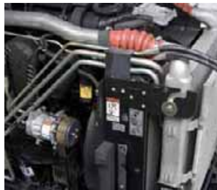
It's simple to inspect and clean both the A/C condenser and hydraulic oil cooler.