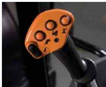
Complete transmission control is found on the convenient seat-mounted multi-controller.

The convenient power shuttle allows you to shuttle between forward and reverse without clutching, without stopping and without removing your hands from the steering wheel. Simply use your fingertips to flick the lever located on the left side of the steering column. Your right hand is always free for loader or implement operation. You can customize the shuttling action by programming the best reverse and forward gears for each job. For loader work, you can power into the pile and back out quickly, or program slower speeds when more precise movement is required.