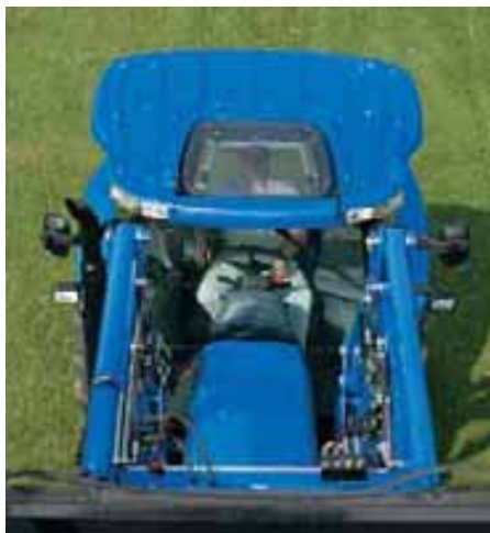
You now have a comfortable view of a raised loader bucket using the standard high-visibility roof panel.

to maintain the temperature you set. The Deluxe cab also features heated electronic external mirrors, a speaker upgrade and electrohydraulic rear remotes as standard equipment.