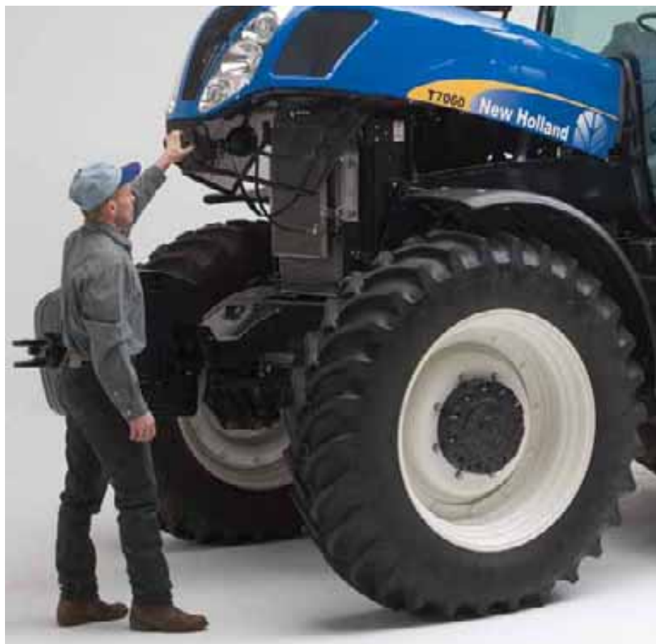
The T7000 features a flip up hood with gas strut, allowing for fast and easy access to the radiator, A/C condenser and engine air filter.

The side-mounted fuel tank has a capacity of 116 gallons for a full day's work in the field. Refueling is fast and convenient with a fill tube that can be reached easily from the ground. Another bonus – the fuel tank doesn't interfere with your visibility to front or back.