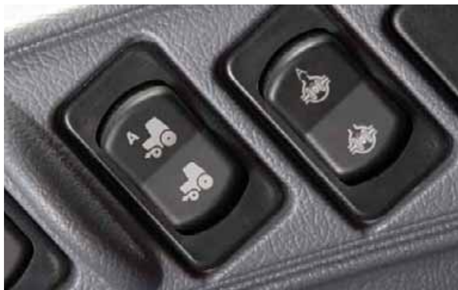
TerraLock™ system automatically controls FWD and differential lock engagement to give you maximum traction and control.