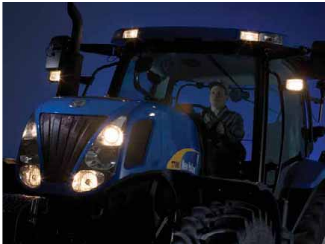
You have plenty of light to work efficiently at any hour with the T7000's best-in-class lighting package.

Working at night or in low-light conditions is not a problem with the T7000 Series tractor. You have a best-in-class lighting package with 12 halogen worklights at the ready. With eight forward-facing lights and four to the rear, you have all the illumination you need to get the job done.